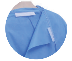
Hook & Loop